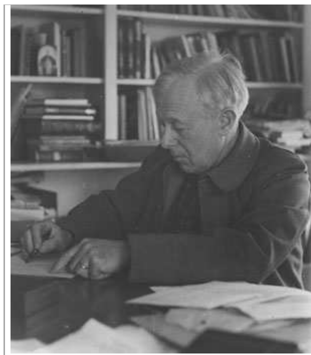
Eugen Rosenstock-Huessy, one of the leading social and religious philosophers of the twentieth century, was a member of the Dartmouth faculty from 1935 to 1957.